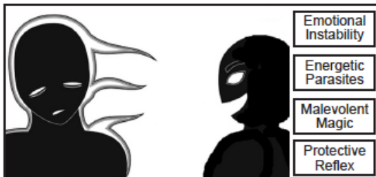
Figure 1.289. Psychic Vampirism.

Reading Assignment: The Hidden Teachings of Christian Mysticism Vol 2, Ch. 3 (p. 40-42) and Ch. 7 (p. 63-65).